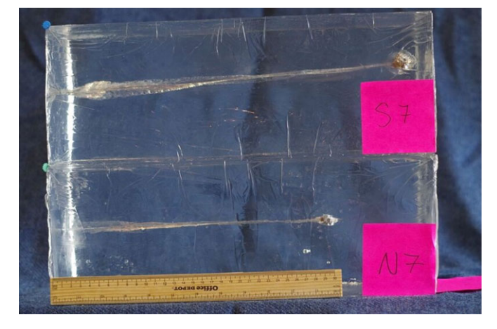
FIG. 3—A representative pair to demonstrate bullet penetration into ballistics gel without (S7) and with (N7) an implant.

one additional nonimplant shot was performed. Among 11 nonimplant shots, nine were pass-throughs. Four of these stayed in the proximal gel, three were stopped by the backstop gel but not embedded in the backstop gel, one embedded into the distal gel with 2.0 cm penetration, and one pass-through was not recovered. Among ten implant shots, zero had a pass-through. Representative pairs are demonstrated in Figs 3 and 4, which depict the nonimplant shots ("S") on top and the implant shots ("N") on the bottom.