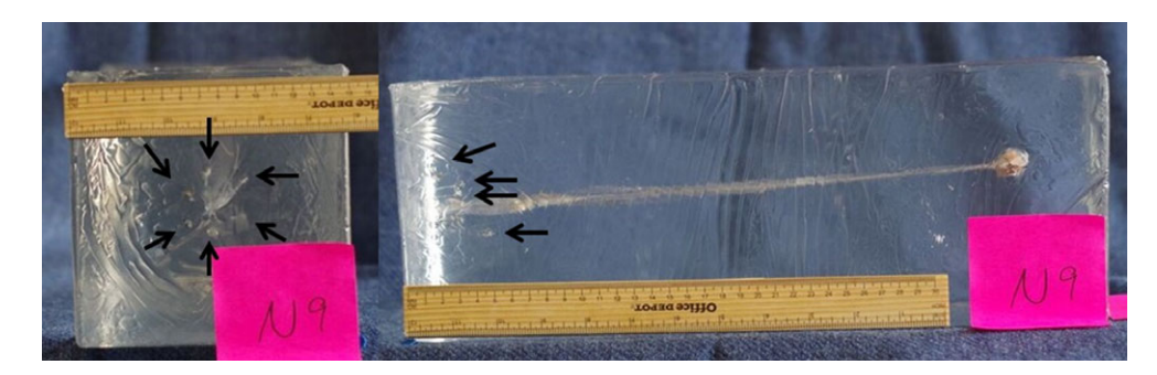
FIG. 6—Orthogonal views demonstrating failure of ammunition (petals detached from main fragment) in an implant shot (N9). Arrowheads demonstrate petals embedded in gel, not in continuity with primary fragment.

As opposed to the medical literature, the popular media has aggressively covered stories where breast implants may have prevented intrathoracic injury in both stab and firearm injuries (19–22). One relevant, heavily publicized case involved a female