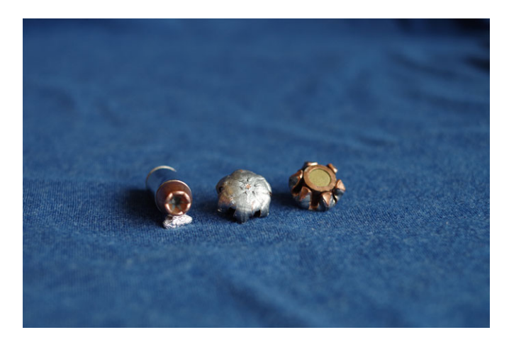
FIG. 5—A "live" (left) and a used, fully mushroomed (center and right) hollow point bullet.

explained by the earlier mushrooming of the bullet as it penetrates the implant prior to contacting the ballistics gel. As the bullet mushrooms, the cross-sectional area increases, thus increasing the drag force applied to the bullet by the ballistics gel (or human tissue). This earlier change in bullet shape likely impacts the effective Ballistics Coefficient of the bullet, resulting in greater bullet retardation and ultimately reduced bullet speed. The experimental findings provide a plausible mechanism