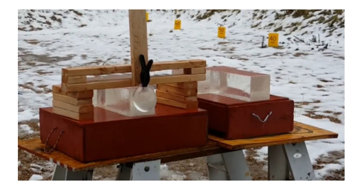
FIG. 2—Experimental design. Experimental group is on the left, and control is on the right.

The ballistics experiment was conducted at a dedicated outdoor firearm range on a single day in December 2016. Range elevation was 5523 feet, and outside temperature was 38°F. Distance from firearm to gel was fixed at 8.0 feet for safety, and a range safety officer was present for the duration of the experiment. Implant and nonimplant shots were taken in pairs approximately 15 sec apart, and the experimental design was subsequently reset. The experimental design and execution in a representative implant and nonimplant pair are shown in Video S1.